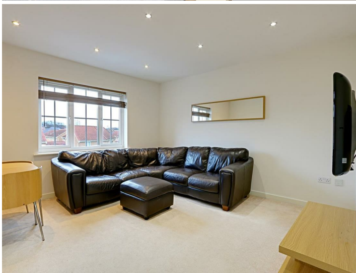
Moorcroft House, Archdale Close, Chesterfield, Derbyshire S40 2GB